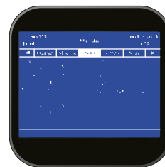
UPS Cabinet Control Panel