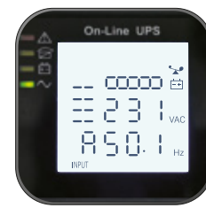
Module Control Panel