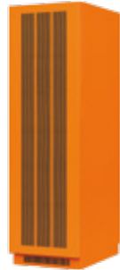
19" Matching Battery Cabinets (Optional)