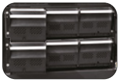
3 U Battery Box Optional